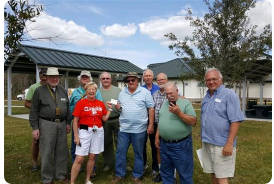
Leap Day 2016 cache